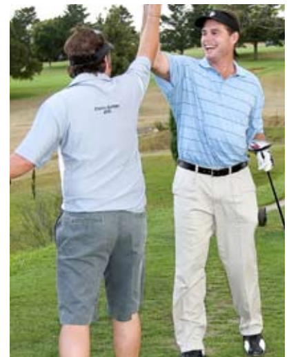
Rassie Erasmus celebrates his tee shot with an old-fashioned high five.